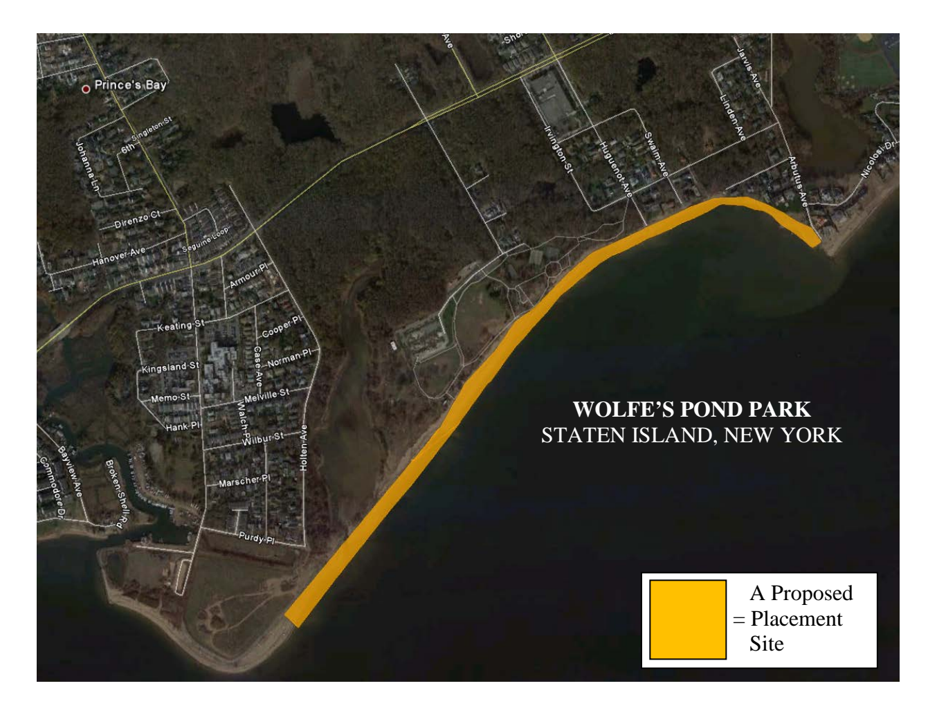
Figure 1A: A Proposed Placement Site