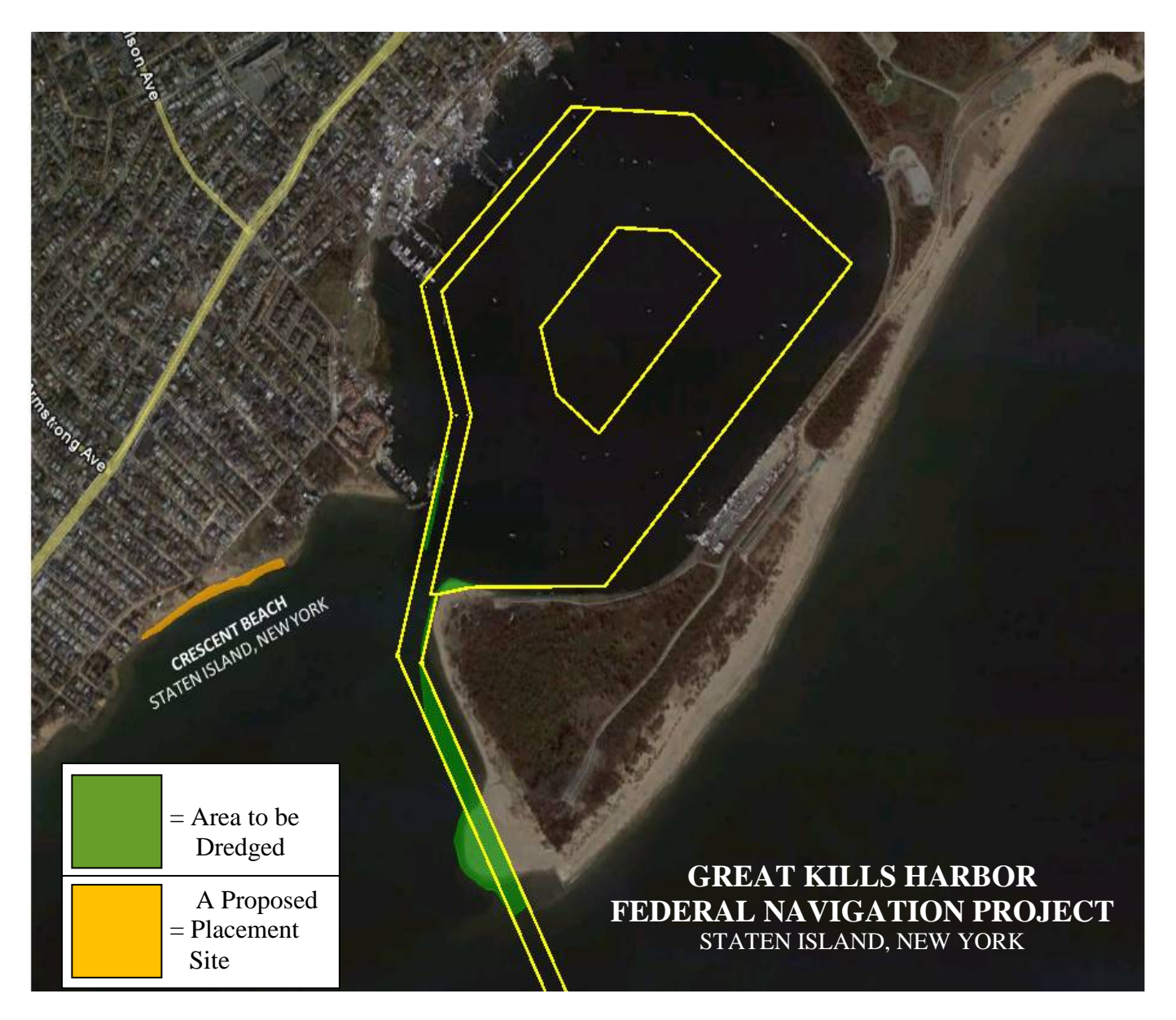
Figure 1: Area to be Dredged and a Proposed Placement Site